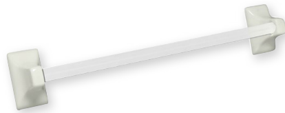
Bone Towel Bar 24"