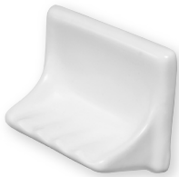
White Soap Dish 4"x6"