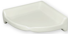
Bone Corner Shelf 8.5"x8.5"