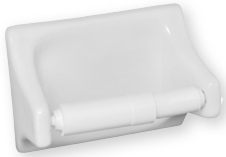
White Toilet Tissue Holder 4"x6"