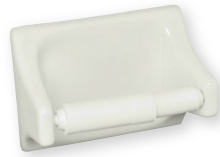
Bone Toilet Tissue Holder 4"x6"