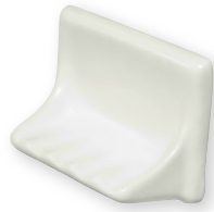
Bone Soap Dish 4"x6"