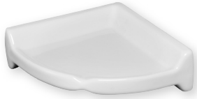
White Corner Shelf 8.5"x8.5"